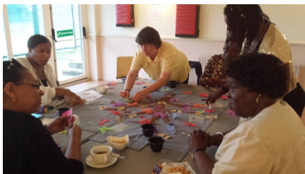
Making of the Banner