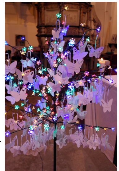
The Celebration Tree of Life

Just reminisce for a minute and reflect to the past, Your brother, your mother, your sister, your father, someone's Dad. Just hold unto them treasured memories for a moment and let them last. So every time you remember that special butterfly, just remember all those sweet memories too, and remember all the good times that special person spent with you. The butterflies have now settled, and are now somehow fastened to the tree, Oh well, I guess that's just where they're meant to be. So hold unto them special memories, although it's so hard, sing a happy song, And the everlasting memories will be sure to live on and on.