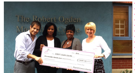
Presentation of cheque to The Robert Ogden Centre