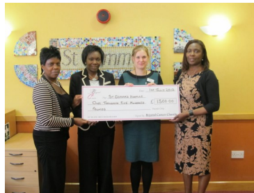
Presentation of cheque to St Gemma's Hospice