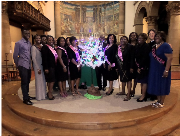
Beyond Cancer Board Members & Volunteers